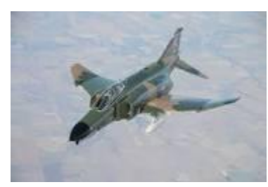
One More Roll